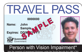
All states and territories