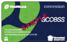
All states and territories

Must show a concession access card issued by TransLink.