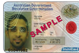
All states and territories

Must show a current ImmiCard issued by the Department of Immigration and Border Protection (DIBP) with a valid regional concession sticker.