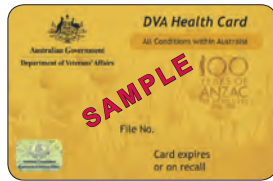
All states and territories