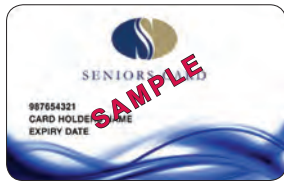
All states and territories