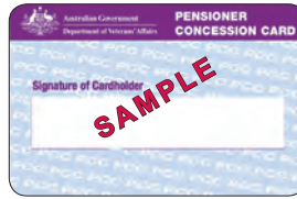
All states and territories